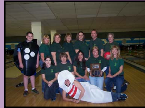
Jamaica Elementary Crocs "School of the Year" Winners